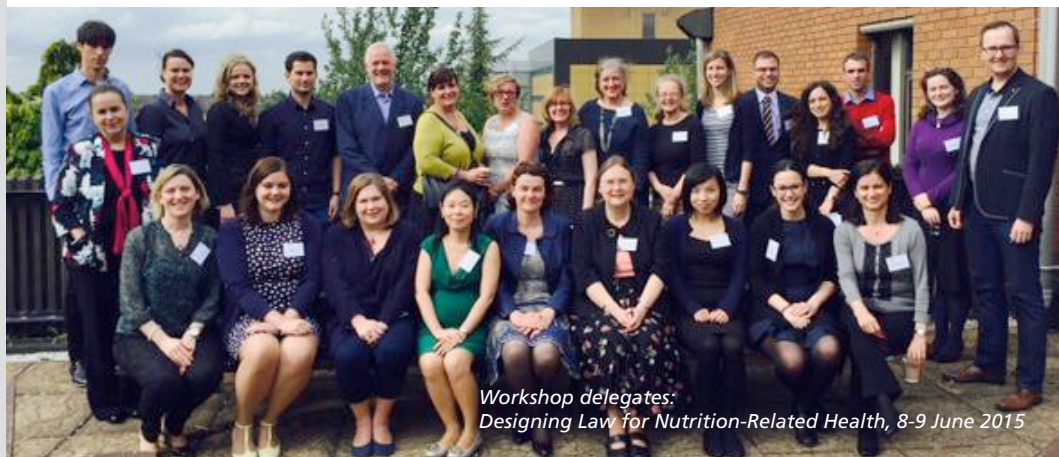
Workshop delegates: Designing Law for Nutrition-Related Health, 8-9 June 2015

The Role of Sleep in Neurological Rehabilitation Date tbc