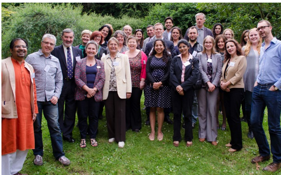
On the Receiving End of Intervention: Methods in Human Security, June 2014

Royal Society of Chemistry Nat. Prod. Rep. , 2013. 30 1165-1210