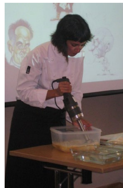
Understanding and Fostering Creativity in the Kitchen July 2014